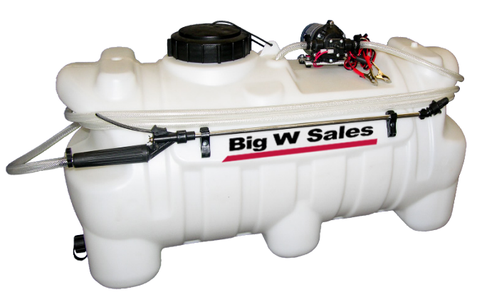
25 Gallon Spot Sprayer